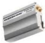
Wavecom Xtend (World)